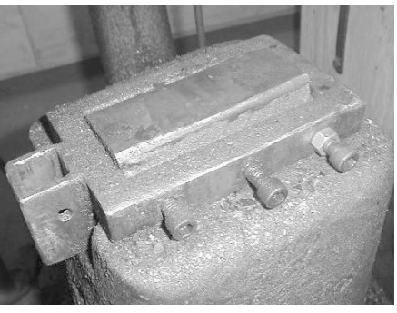
Figure 8: Removable hardy hole

vou make it with this idea in mind). Weld up a heavy 'ring' of steel (See Fig. 1) that clamps around the dies and weld a box (two pieces of angle iron, sistered together) to one side. Add a couple of lock bolts (and I strongly suggest the use of the lock nut as shown in Figure 1) and you now have a hardy hole on your Tools hammer. can be as simple as a fullering plate (Figure 2) or as elaborate as a set of spring dies. Use